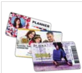
RFID / Gift / Barcode cards