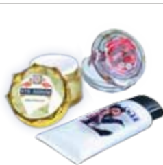
Beauty care products