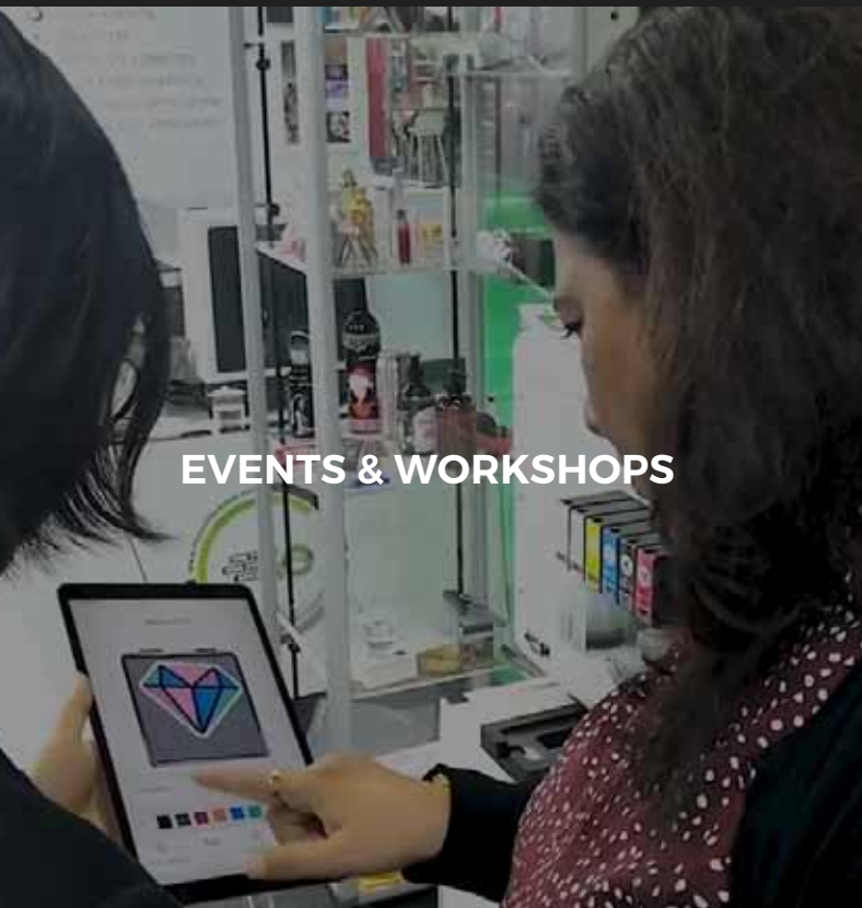
EVENTS & WORKSHOPS