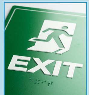
Signage & Braille