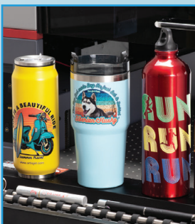
360 Rotary Personalization