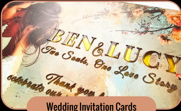
Wedding Invitation Cards