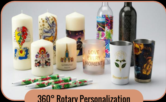
360° Rotary Personalization