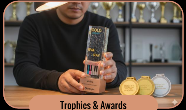
Trophies & Awards