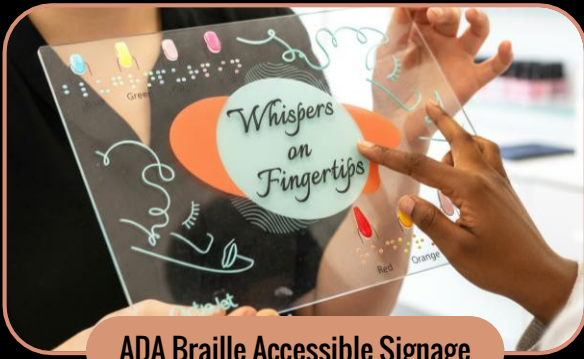
ADA Braille Accessible Signage