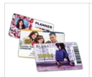
RFID / Gift / Barcode cards